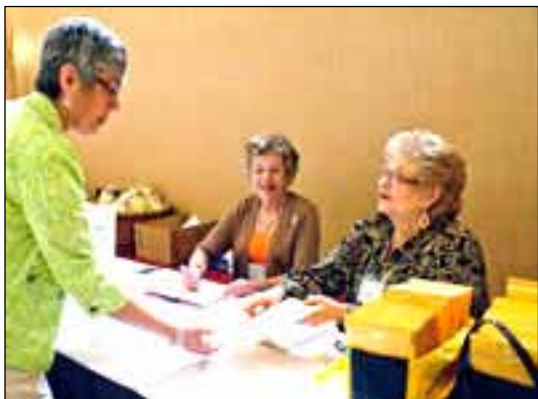
• REGISTERING FOR CONVENTION