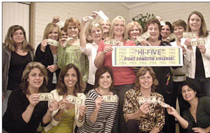
• CANFIELD MEMBERS , shown here at one of their meetings, supported a project for prevention of domestic violence at a Northeast District meeting. The Junior Women's League of Canfield collected $65 in $5 bills. It was HI5 for a domestic violence awareness campaign.