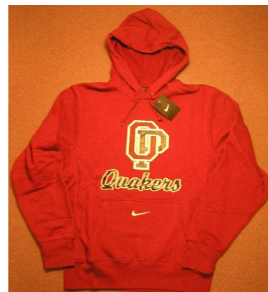
NIKE HOODED SWEATSHIRT.....$40 (ASH GREY OR MAROON) SCREENED "OP QUAKERS" LOGO IMPRINT ON CHEST. (55% POLYESTER/45% COTTON) SIZES: S, M, L, XL, OR 2X