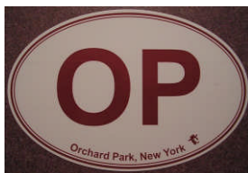
DECAL.....$3 WHITE WITH MAROON "OP" LOGO. (4"x6")