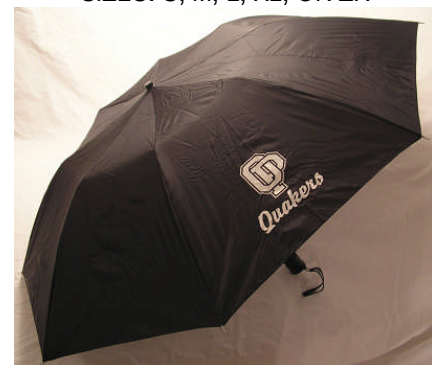
PERSONAL UMBRELLA.....$15 BLACK WITH SCREENED "OP QUAKERS" LOGO IMPRINT ON ONE PANEL.