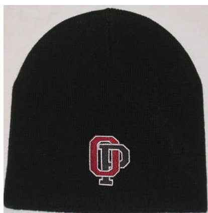
KNIT BEANIE HAT.....$15 BLACK WITH EMBROIDERED "OP" LOGO. (100% ACRYLIC) ONE SIZE FITS ALL