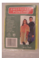
EMERGENCY RAIN PONCHO.....$3 YELLOW WITH RE-USEABLE STORAGE BAG.