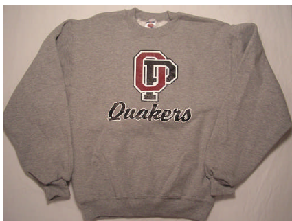
CREW SWEATSHIRT.....$20 (ASH GREY OR MAROON) SCREENED "OP QUAKERS" IMPRINT ON CHEST. (55% POLYESTER/45% COTTON) SIZES: S, M, L, XL, OR 2X