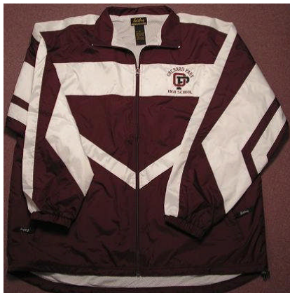
EASTBAY JACKET.....$40 (XL ONLY - "FITS BIG") ONLY 1 LEFT!!