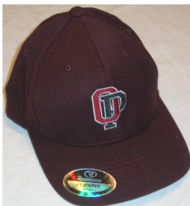
FLEX-FIT BASEBALL CAP.....$20 MAROON WITH EMBROIDERED "OP" LOGO. (83% ACRYLIC/15% WOOL/ 2% PU SPANDEX) SIZES: S/M OR M/L