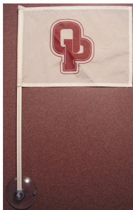
WINDOW FLAG.....$10 WHITE FLAG WITH MAROON "OP" SCREENED LOGO IMPRINT. INCLUDES PLASTIC FLAG POLE AND CLEAR SUCTION CUP.