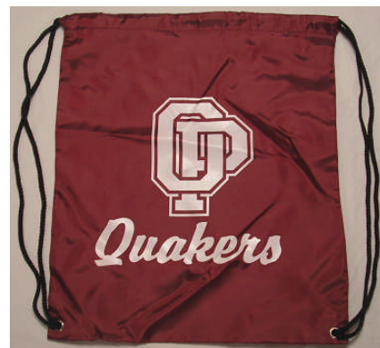
DRAW STRING BACKPACK.....$7 MAROON WITH SCREENED "OP QUAKERS" LOGO IMPRINT ON ONE SIDE.