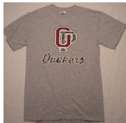
T-SHIRT.....$15 ASH GREY WITH SCREENED "OP QUAKERS" LOGO IMPRINT ON CHEST. (90% COTTON/10% POLYESTER) SIZES: S, M, L, XL, OR 2X