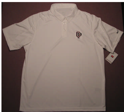
NIKE FIT-DRY GOLF SHIRT.....$45 WHITE WITH EMBROIDERED "OP" LOGO ON LEFT CHEST. SIZES: L, XL, OR 2X