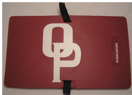
FOAM SEAT CUSHION.....$10 MAROON WITH SCREENED "OP" LOGO IMPRINT ON ONE SIDE. ONE SIZE FITS ALL.