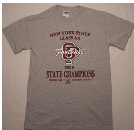
CHAMPIONSHIP T-SHIRT.....$15 ASH GREY WITH SCREENED OP FOOTBALL CHAMPIONSHIP LOGO IMPRINT ON CHEST. (90% COTTON/10% POLYESTER) SIZES: S, M, L, XL, OR 2X