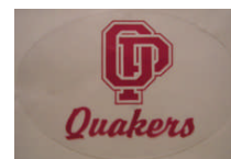
MINI WINDOW CLING.....50¢ CLEAR WITH MAROON "OP QUAKERS" LOGO. (2"x3")