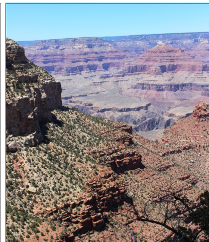
View of the Grand Canyon while on tour.