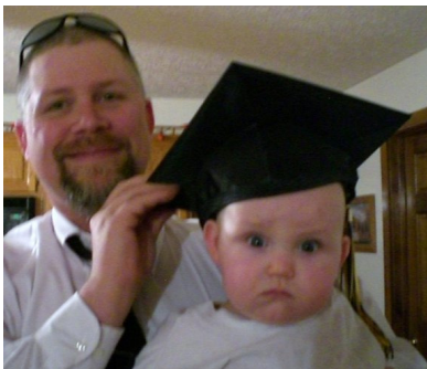
The Current Graduate, The Future Graduate: