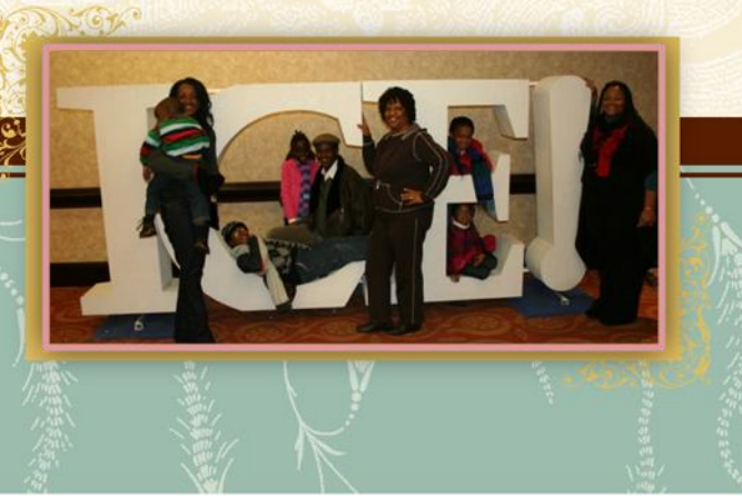
Reminders: Continue to collect canned goods, toiletries, and clothing. Before Summer, we will donate all collected canned goods to the Treasure Coast Food Bank. In addition, the teens are collecting toiletries for donation to the Restoration House. Lastly, our chapter will donate items to the Haitian Relief Efforts.

SNOW was a carnival style activity. Jacks and Jills threw snow balls, enjoyed snow tubing, and played various carnival style games. Everyone left for the night exhausted from a great day out with our children.