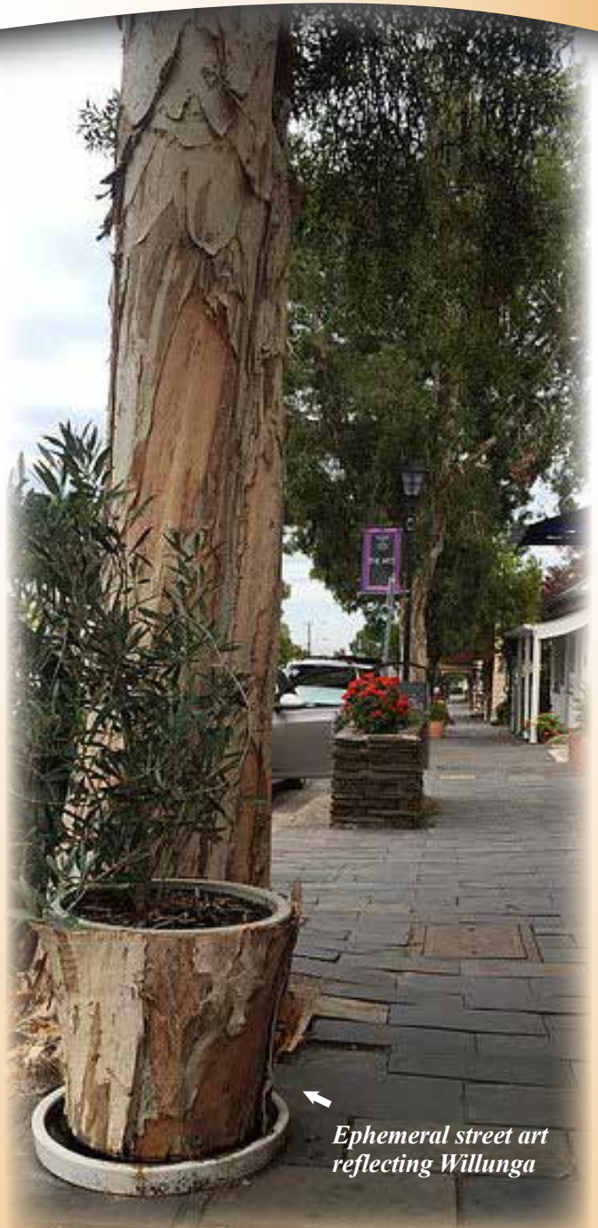
Ephemeral street art reflecting Willunga