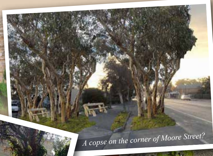
A copse on the corner of Moore Street?