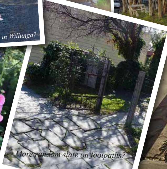
More random slate on footpaths?