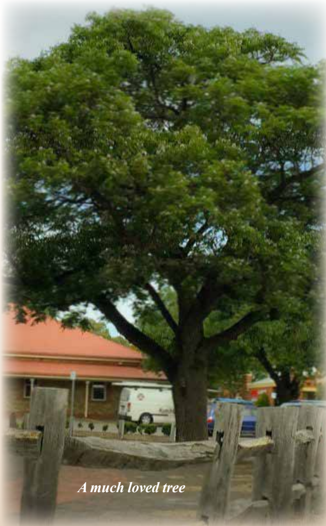
A much loved tree

This duck lives in Willunga Do you know where?