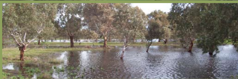
Hart Road Wetland