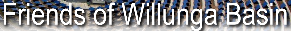
Image above: Torresol Gemasolar Concentrating solar thermal power station in Spain