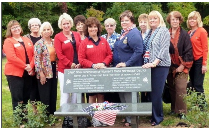
Northeast District Members attend the Gold Star Mother's Pilgrimage and bench dedication. Pictured are members from the Boardman Poland Junior Women's League, Warren Junior Women's League and Warren City Federation.