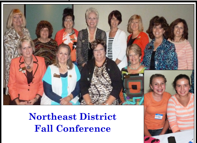
Northeast District Fall Conference