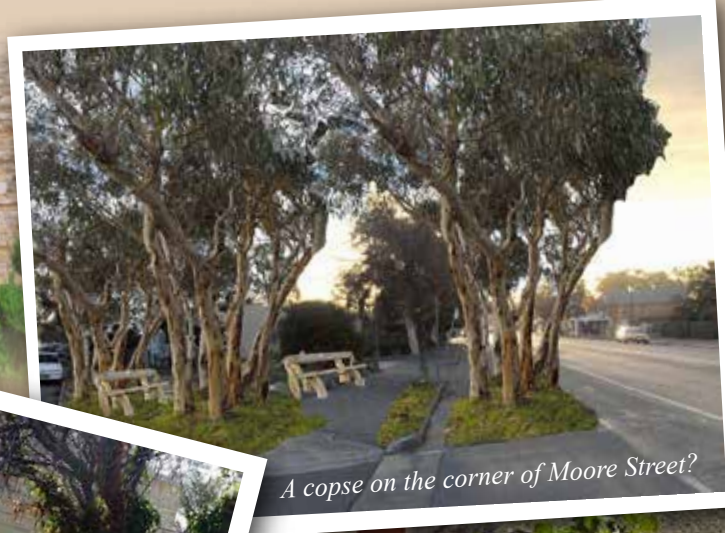
A copse on the corner of Moore Street?