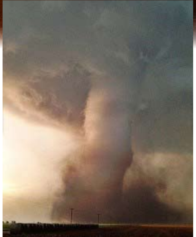
Image above: this week's unprecedented tornado which caused havoc in Oklahoma. and below: the resulting devastation

Perhaps now is the time to write to our politicians and newspapers. Tell them that this danger cannot be ignored, and as Australia is top of the class for per capita emissions we have a moral imperative to lead, not follow. Moreover the CSIRO anticipates climate change to have more drastic impacts on Australia than most other parts of the world.