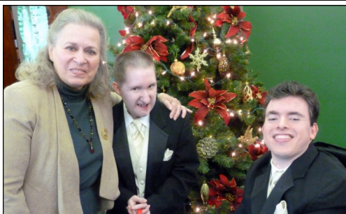
WJWL'S TWO HANDSOME GREETERS WITH OFWC PRESIDENT